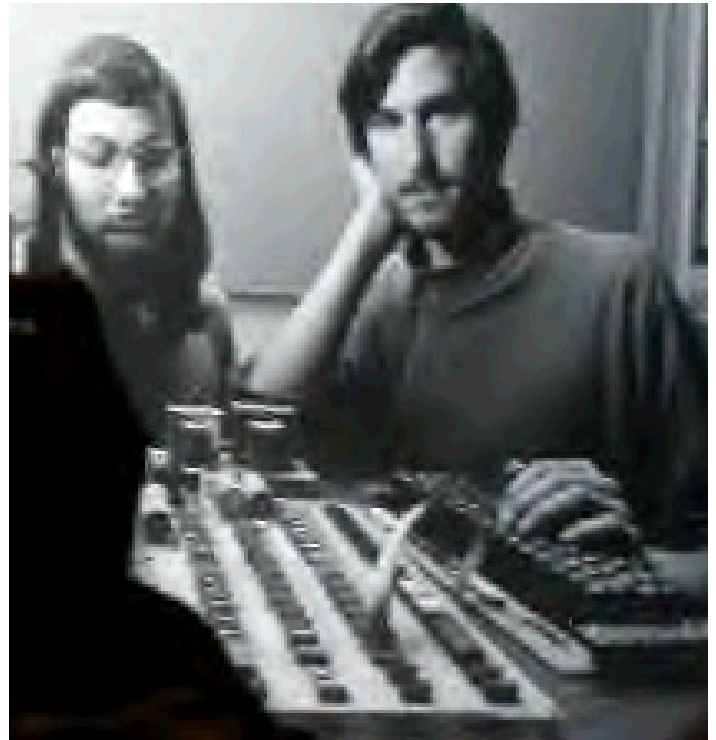
Yep. The Steve's.